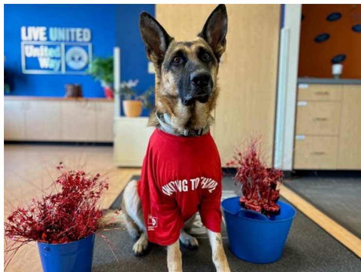
Meet Lizzie our 211 Resident Dog